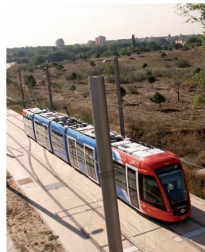
Light Metro in Madrid.