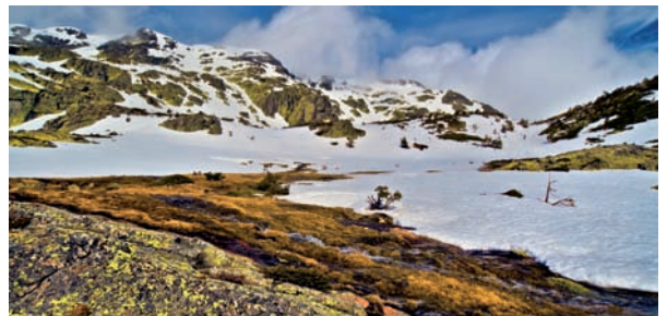
Peñalara Natural Park.