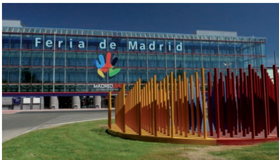
Juan Carlos I Fairgrounds.