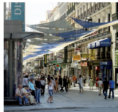
Specialised shops in Madrid.