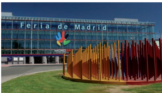
Juan Carlos I Fairgrounds.