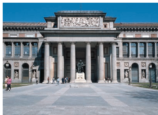
The Prado Museum is one of the main attractions for cultural tourism in the Comunidad de Madrid.