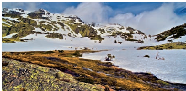
Peñalara Natural Park.